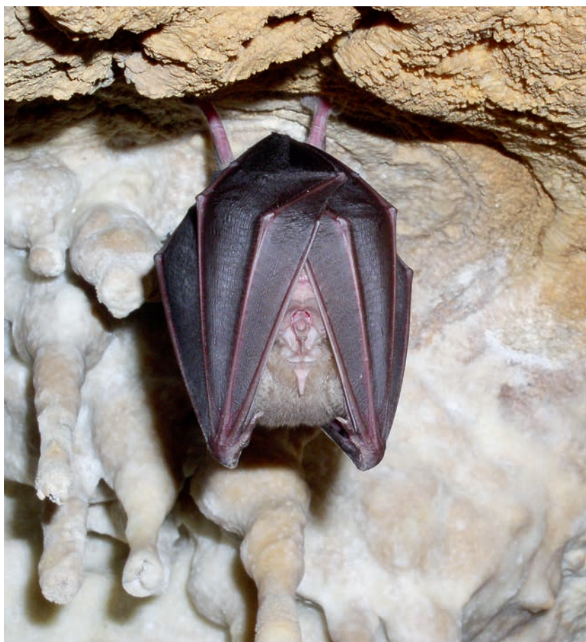
Fig. 2. Photograph of Rhinolophus ferrumequinum found in the Javoříčské caves.

While R. ferrumequinum has been registered in the Czech Republic since the 19th century (Gaisler 1956), it is very scarce and is only documented by isolated findings of hibernating individuals (Hanák & Anděra 2005). Most findings have been located in Moravia, though the latest published records are situated in the Český les Mountains (Červený et al. 2006), with two males recorded in the Černá Řeka gallery during winter monitoring (4 December 2006). This represents only the seventh record in the territory of the Czech Republic since 1950. The last Moravian finding originates from the Moravian Karst region in 1979 (Gaisler 1997). Our findings are increasing the number of known observations of five, however, the number of individuals, may be smaller. In the case of the Javoříčský kras observation, for example, it can be assumed that it was the same individual observed over the course of the year (May 2006 to July 2007). This is also suggested by the lack of further observations of R. ferrumequinum in this intensively monitored area. Indeed,