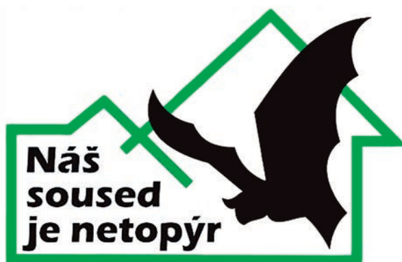
Fig. 3. The plaque “Our Neighbour the Bat”, a symbol of consent to sharing the same building with bats. Thirty-nine such plaques have been awarded.

Advertising the protection and conservation of bats has been one of the main objectives of CBCT since its foundation, yet new types of education and enlightenment seem necessary in the second decade of the Trust's existence, such as spreading general information about the life and endangerment of bats on various occasions (including European Bat Nights, EBN), lectures and workshops for students at schools, submitting information to construction firms and training designers and builders, and affording consultations concerning bats to anybody by e-mail and