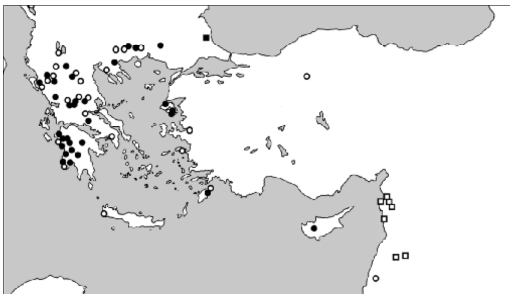
Fig. 2. Records of Pipistrellus pygmaeus (full symbols) and P. pipistrellus (open symbols) in the Eastern Mediterranean. Circles denote records of both forms after Hanák et al. (2001), Mayer & Helversen (2001a), and Dietz et al. (2002). The squares denote sites of records of P. pipistrellus in Syria and of P. pygmaeus in Turkey.

Our record of P. pygmaeus in Turkish Thrace is the first finding of this species in the country (Fig. 2); until now, only two records of this complex identified to species were mentioned from